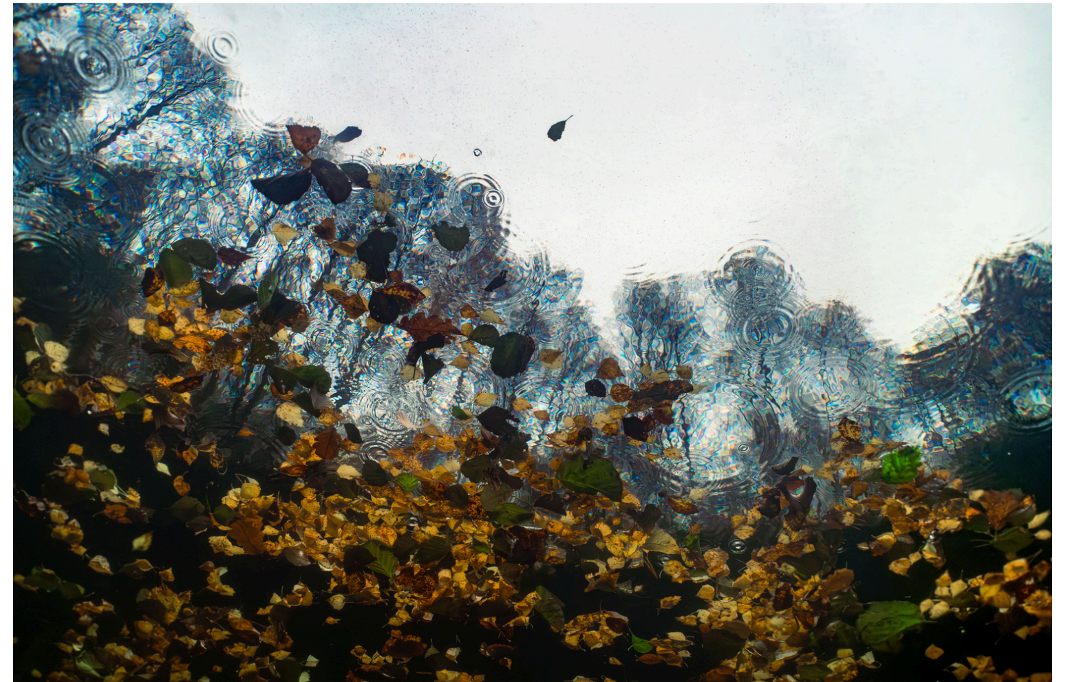
7. Gustaf Svensson