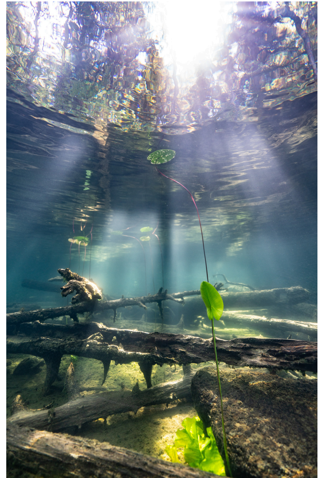
13. Tommi Pasanen